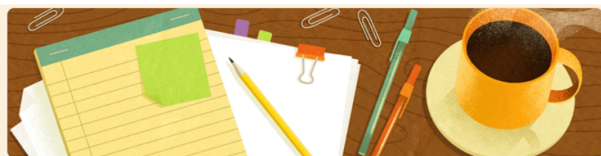
Young Artist Auditions - Financial Form